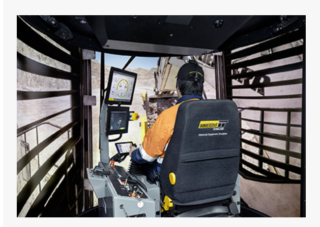
Simulator for Liebherr R9600 Diesel Excavator

The company had a very healthy development pipeline of new Conversion Kit modules for a diverse range of Original Equipment Manufacturers (OEM). This is set to continue with projects underway for new and existing customers for heavy machinery manufactured by <u>Caterpillar®</u>, <u>Epiroc, Sandvik</u>, <u>Hitachi</u>, <u>Komatsu</u> and <u>Liebherr</u>.